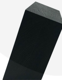
21 Degree Angled Plinth | 212x70x141