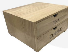
Oak Tea & Coffee Station | 424x398x244