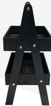
2-Tier Adjustable A-Frame | 415x300x640