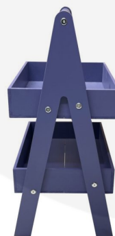
2-Tier Adjustable A-Frame | 415x300x640