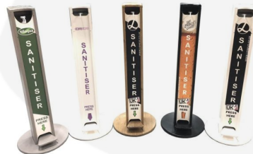
Pine Hands Free Hand Sanitiser Dispenser Stand | 1030x400D