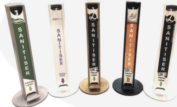
Pine Hands Free Hand Sanitiser Dispenser Stand | 1030x400D