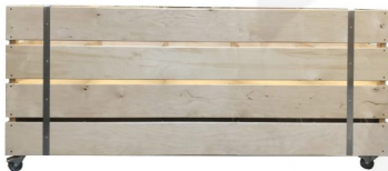
Mobile 5 Bin Impulse Merchandise Display Stand 1500x300x670