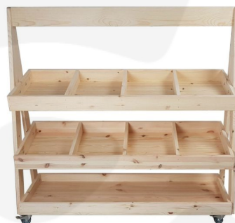
Mobile 3-Tier Slanted Merchandiser Display Stand | 1190x370x1145