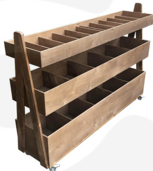
Mobile Albert 3-Tier Queue Divider Display Stand | 1551X360X1065