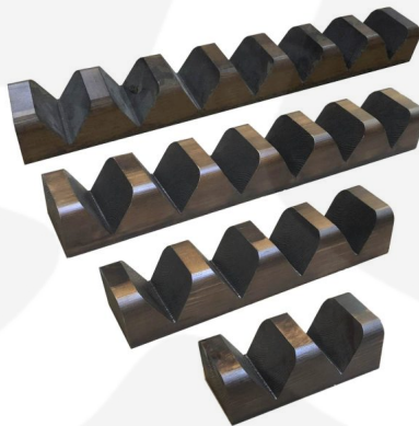
Redwood 6 Taco Stand | 571x95x70