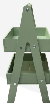
2-Tier Adjustable A-Frame | 415x300x640