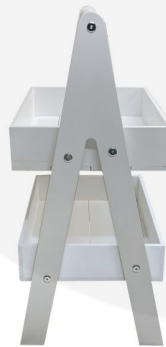
2-Tier Adjustable A-Frame | 415x300x640