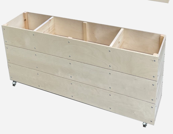
*Bepsoke stains and colours are available on request.